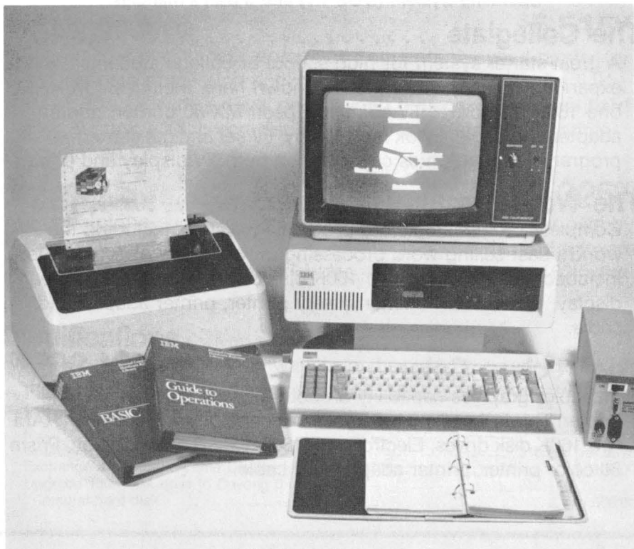
The "Techno-Color" System with Davong Hard Disk Drive